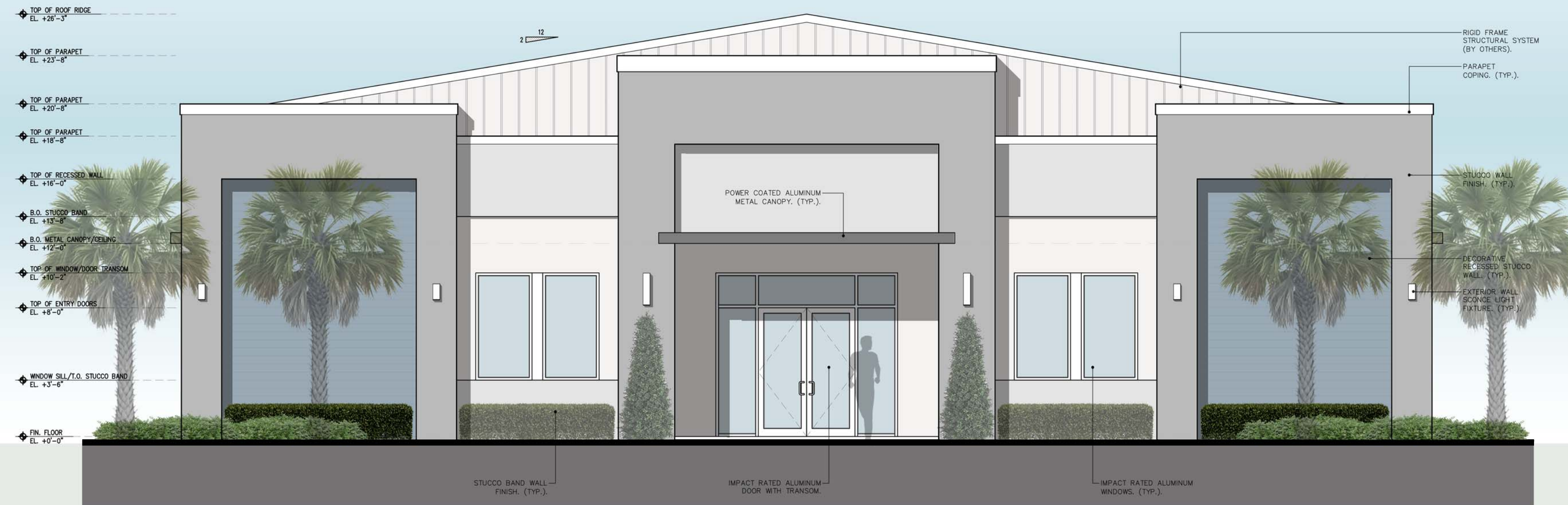
1 Proposed North Elevation :: Front SCALE: 3/16"=1'-0"